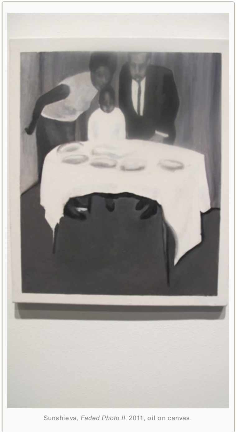
Sunshieva, Faded Photo II , 2011, oil on canvas.