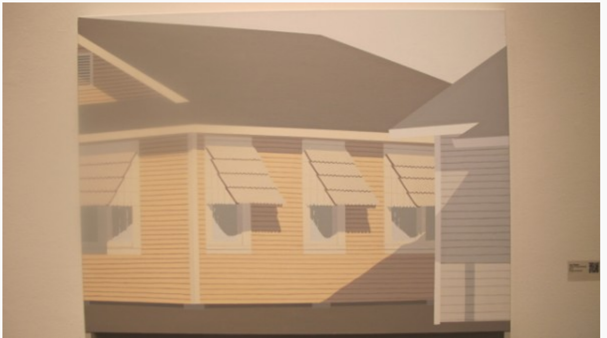
Cary Reeder, Three O'Clock Shadow , 2012. Acrylic on canvas.